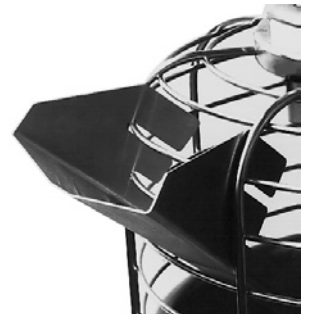
Hobart Ingredient Chute

Listed by Underwriters Laboratories Inc. and certified by NSF International.