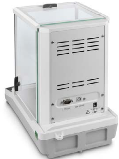
KERN ACS/ACJ with standard data interface RS-232 and USB data interface

The bestseller in analytical balances, with high-quality single-cell weighing system, also with EC type approval [M]